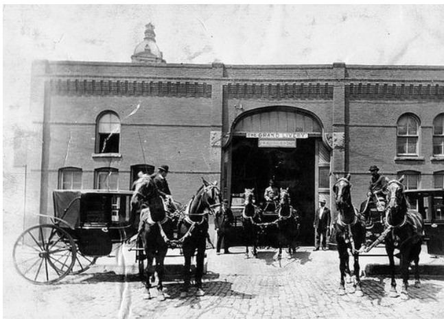
The Grand Livery, Council Bluffs