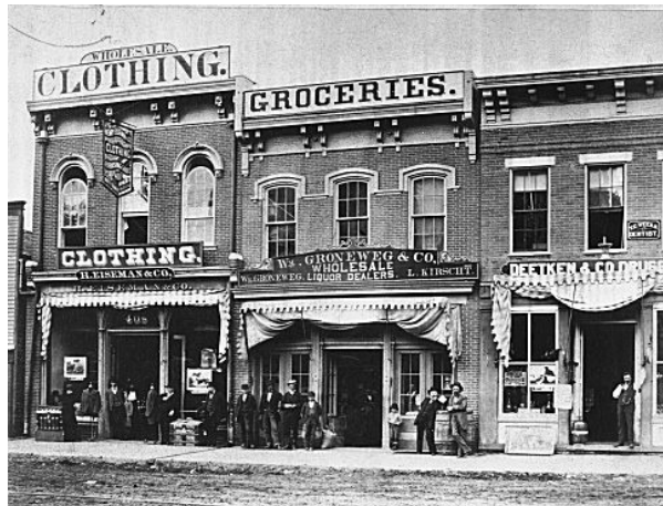
Main Street Shops in Council Bluffs, 1880s