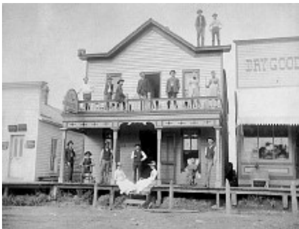
City Hotel, Council Bluffs, 1860

In those days, several doctors served the community, but there were no hospitals. The first bank was opened. Mercantile stores, saddle and harness shops, livery stables, small grocery stores, saloons and brothels, several churches and fledgling businesses offered products and services to those who settled here, usually comprised of new arrivals or pioneers on their way westward.