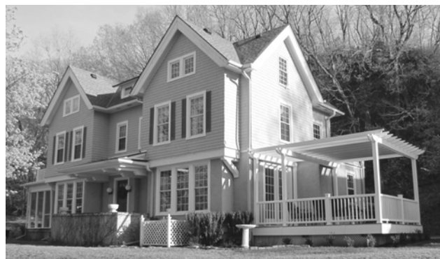
The John J. Hess House, 528 Clark Ave.