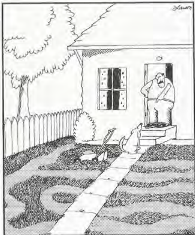
"You call that mowin' the lawn? ... Bad dog! ... No biscuit! ... Bad dog!"